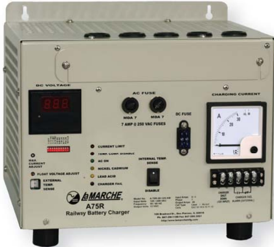
Model shown: A75R-20-12V-AB1